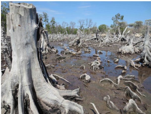
PLATE 3 Clear cutting of Rhizophora mucronata and Ceriops tagal in response to demand for lime in 2013.

differences between households in lime production and consumption, for example according to wealth and migration status. If migration into coastal villages continues, incomes rise, and demand for building timber and lime render grows, how can mangrove harvesting patterns and rates be managed in such a way as to allow mangrove regeneration?