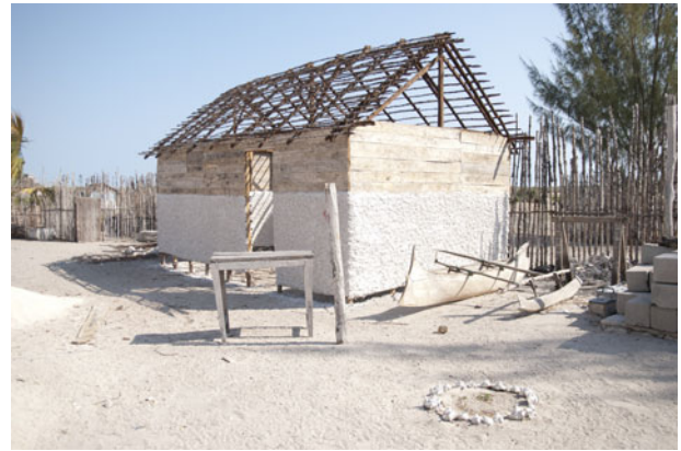
PLATE 1 A house wall with wooden frame and lime render.

Coastal areas in Madagascar are increasingly experiencing in-migration, as poor agricultural households move to the coast seeking more secure livelihoods (Bruggemann et al., 2012). Data are scarce, but there is evidence that the Bay of Assassins is experiencing significant in-migration. For example, in the villages of Lamboara and Ampasilava < 30% of inhabitants were born in those settlements (Epps, 2007). The region's arid climate and the growth in marketing opportunities for marine produce have encouraged people to turn from inland agriculture to coastal fishing